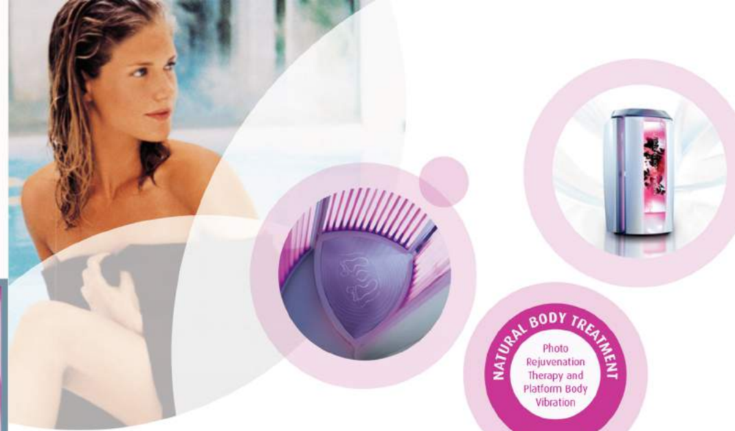
PHOTO REJUVENATION THERAPY